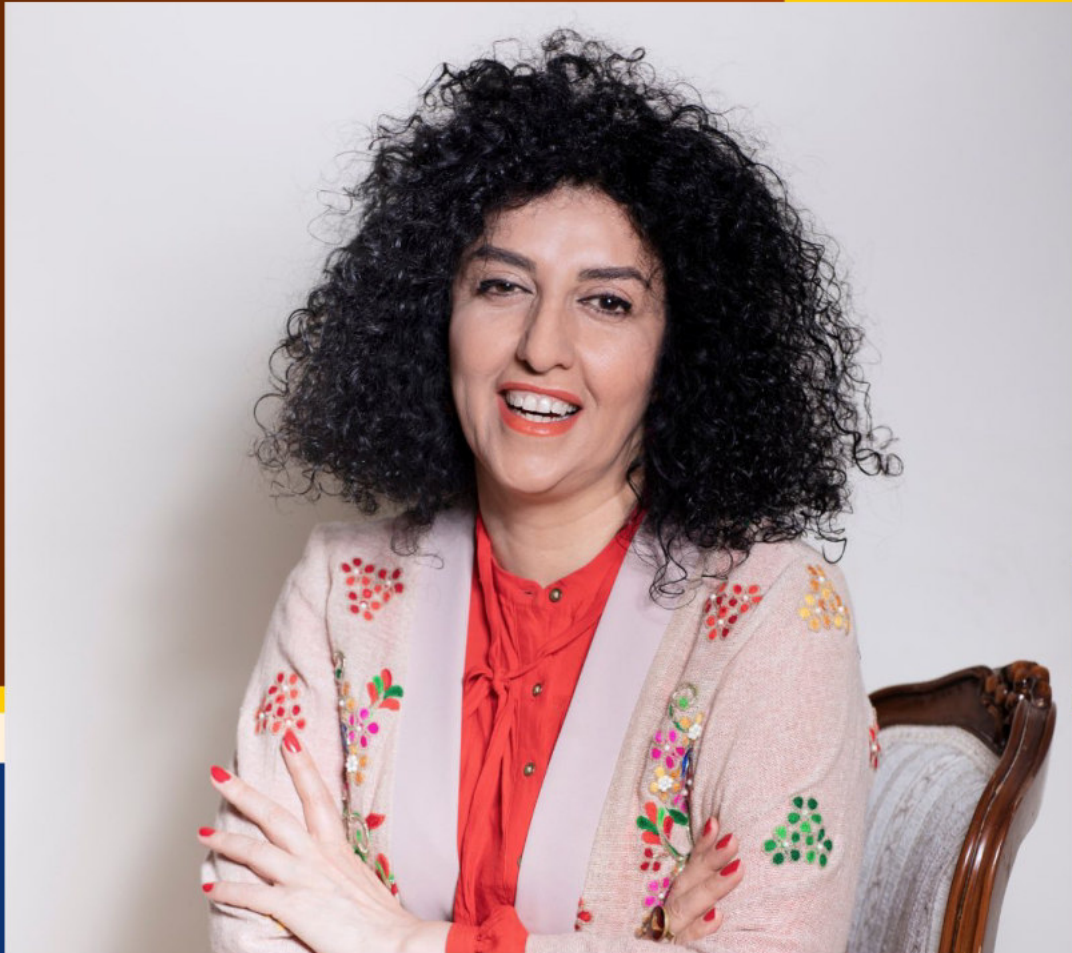
Human rights activist Nargis Mohammadi

☎ 94250-68121, 98939-29541 to get your queries answered fast.