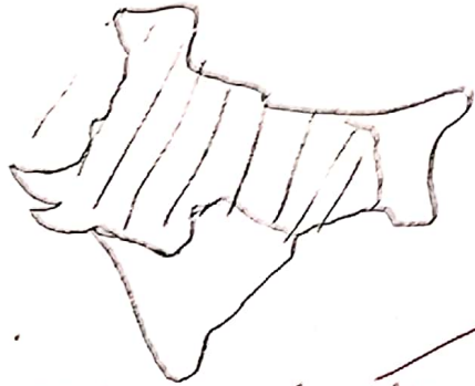
Fig. Mughal Empire in 16 th century